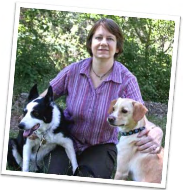
Left: "Homer", Right: "Magpie"